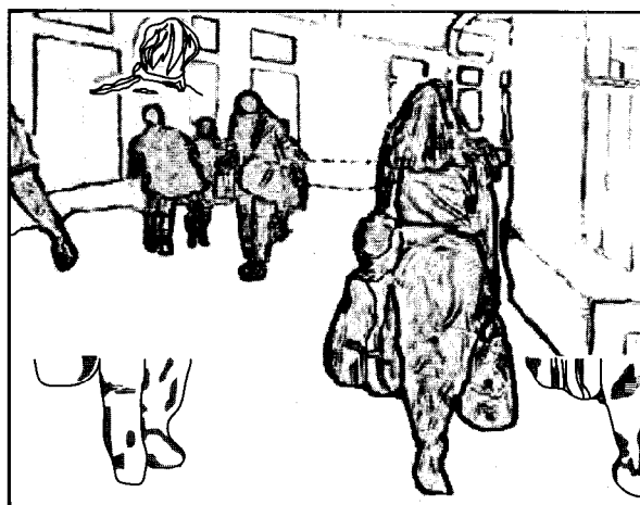
Partial ghost images provide cues that allow a person wearing Eli Peli's prism glasses to avoid obstacles. At left, a man's head and feet become visible in the glasses. Only his arm would be visible otherwise.

If you are interested in trying a prism system, first discuss it with