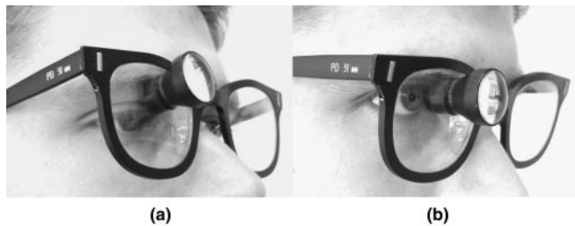
FIGURE 1. A bioptic telescope used for driving (3.0× Galilean, the type most commonly used by subjects in our survey). (a) The driver views below the telescope most of the time, (b) viewing only intermittently through the telescope by a downward tilt of the head.