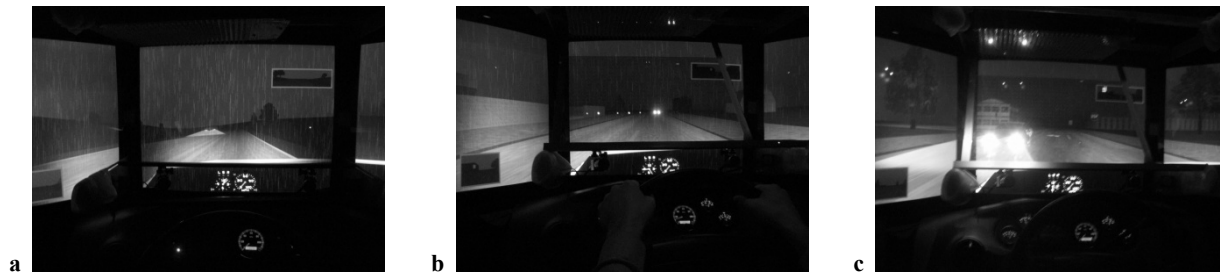
Figure 2. The night driving scene (a) without the glare system enabled, (b) simulating a distant vehicle, (c) simulating a close vehicle. The display and beam splitter can also be seen in (b) and (c).