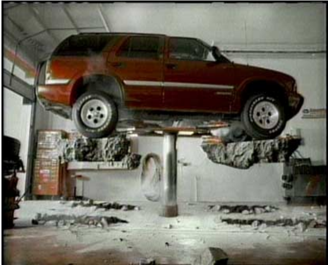
Figure 2 a. The original decompressed image used, PSNR= 35.5 dB