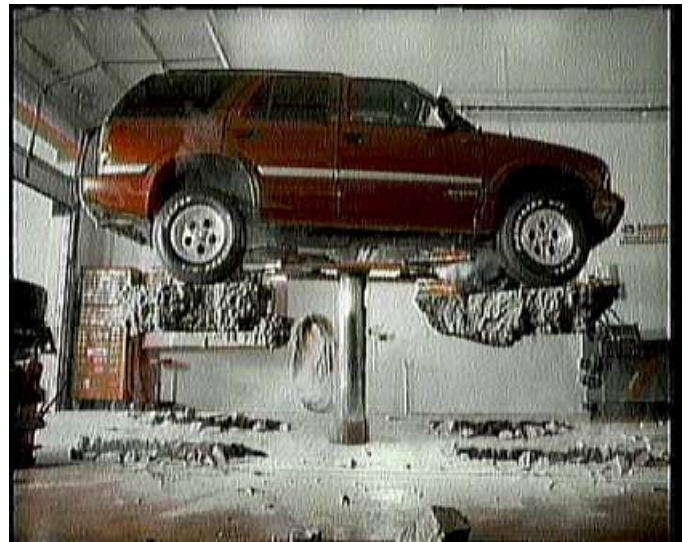
Figure 2d. Enhanced image with one direction with \lambda=1.9 . Note, many of the compression artifact seen in this prints are not visible on the screen display of this image