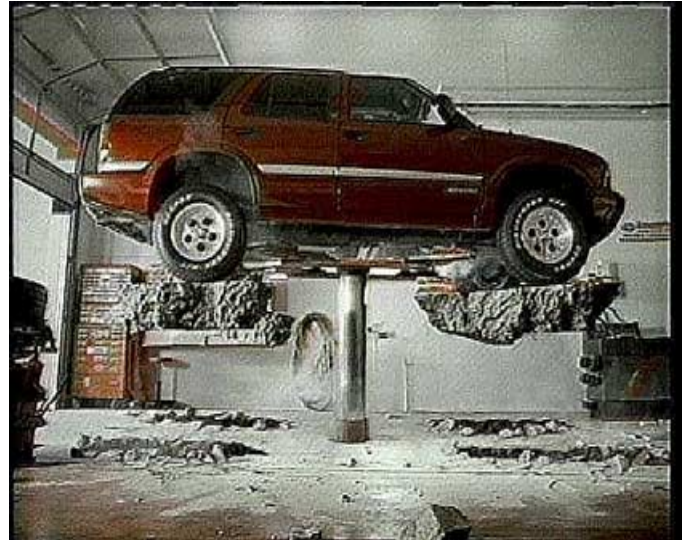
Figure 2c. The image of fig2a enhanced with \lambda = 1.5 . Higher levels of enhancement cause artifacts noted even by visually impaired people.