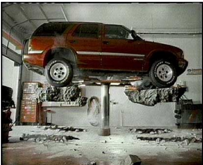
Figure 2b. The image of Fig. 2a enhanced with \lambda = 1.2 . The effect of the enhancement as seen on the TV monitor is more dramatic than appears in print here (see PDF file).